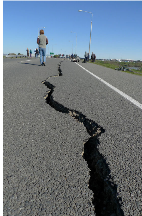
"Earthquake damage - Bridge Street"

If you are indoors or outdoors it is best to DROP, COVER and HOLD.