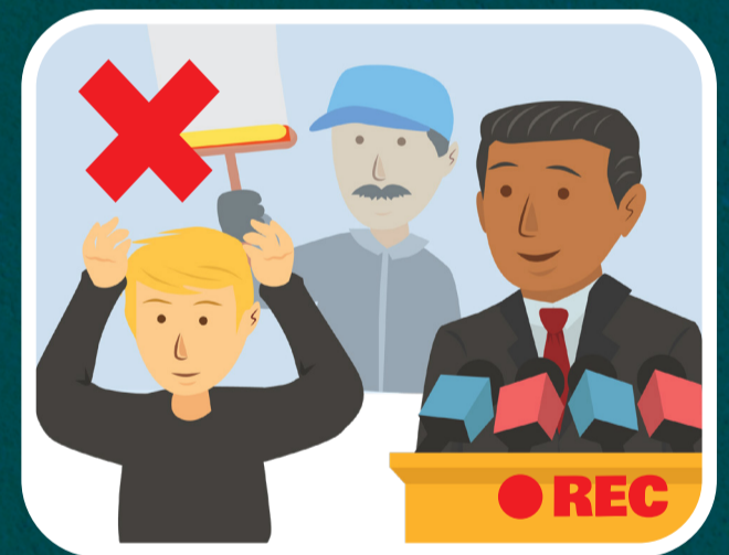
Free of distractions